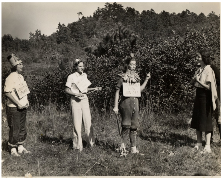
Wizard of Oz themed Tinker Day skit from the 1940s.

As the days become shorter and the mornings begin to chill, a familiar chatter begins to fill the air: