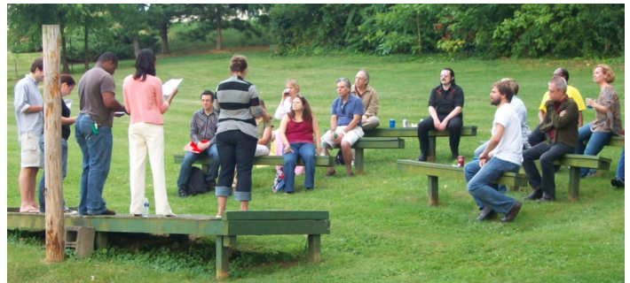
Reading House of Atreus for Playscript Analysis last summer

After the success of the reading at Fullerton, House of Atreus is slated for a full production at Orange Coast College (Engard's alma mater) in November.