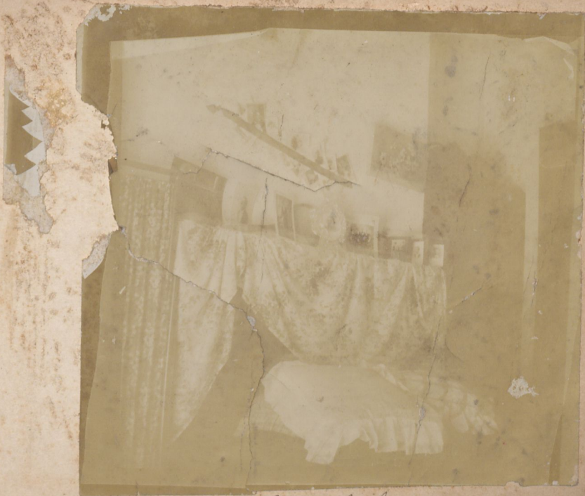
The Rabb-Scherr room