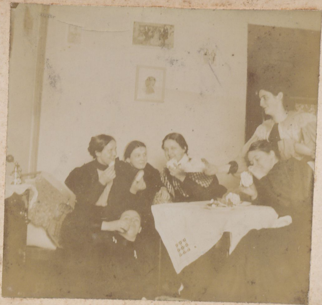
Sunday morning - 97.