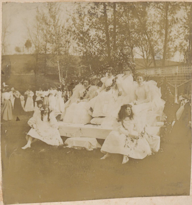
May Day, 1898