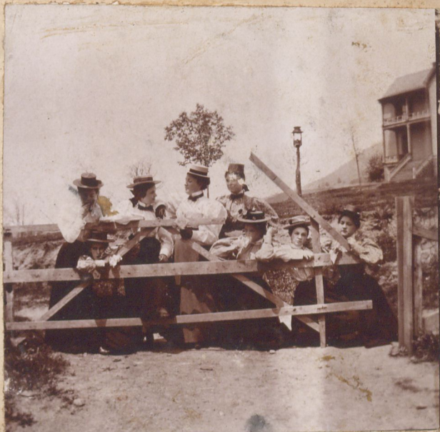
Babb Block Scherr