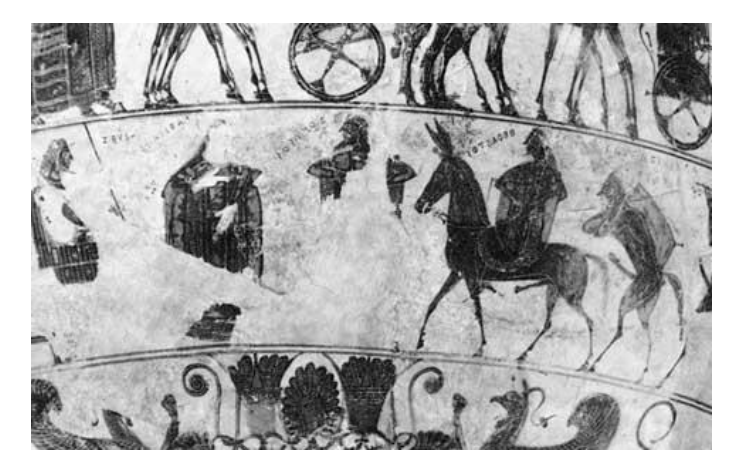
Fig. 1: François Vase, c. 570 BCE

Aphrodite.<sup>10</sup> An ithyphallic satyr follows behind, carrying a wineskin. Although not shown in this image, Hera also appears on the vase still restrained by the bonds of the chair Hephaestus had sent her.<sup>11</sup> The vase therefore serves as one of the most