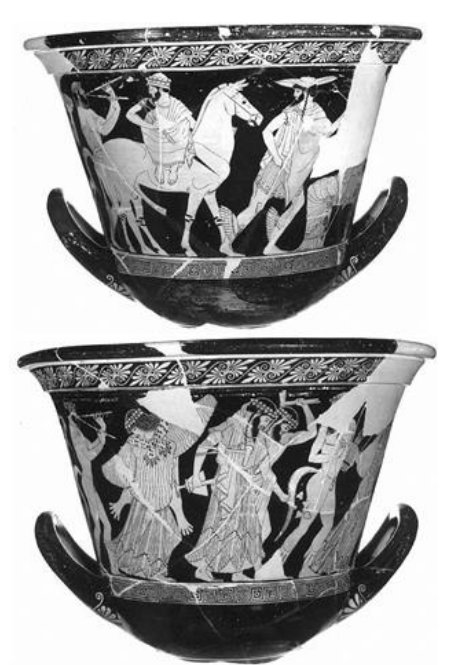
Fig. 4: Attic Red-Figure Calyx Krater, c. 480 BCE

The attitudes of the satyr participants change in later depictions. Eventually, they transition from focusing primarily on their sexual enthusiasm to joining in jubilant revelry of the return. During the Classical period, they frequently appear playing various musical instruments as they walk in a festive manner more appropriate for ritualized procession. These Classical satyrs typically do not display the enhanced, erect phalluses of their predecessors, which would have corresponded to the ritual of inversion present in Dionysiac procession, <sup>22</sup> but instead are portrayed more modestly. While this shift is indeed representative of the Classical style, it also