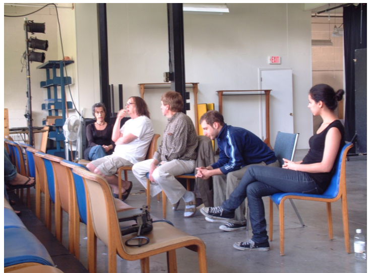
The creative team of Fever Chart in the old studio space before renovation.

We think he succeeded, and so does the University. We get to get to keep it!