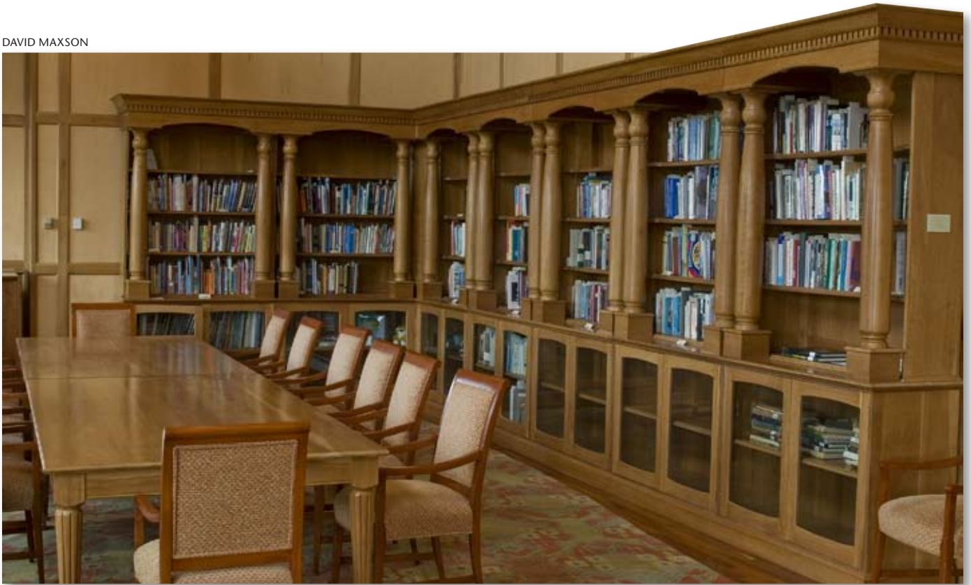
The Hollins Room, showing a portion of the Hollins Authors Collection, including the Margaret Wise Brown Collection.