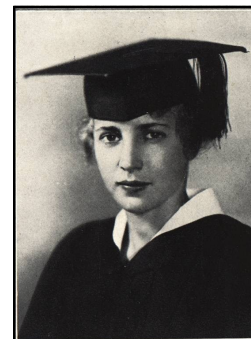
Margaret Wise Brown (class of '32)